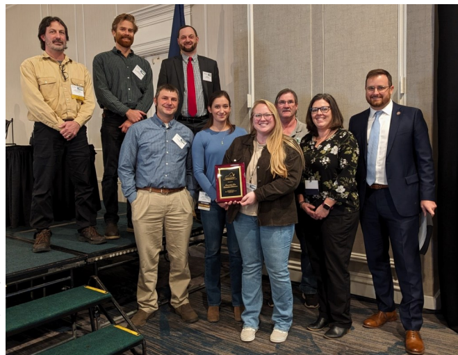
Collaborative partners in attendance accepting the award at the VASWCD Annual Meeting in December of 2023.

The Shenandoah Valley Conservation Collaborative (SVCC) advances conservation outcomes through a partnership that coordinates expertise, identifies opportunities, and motivates action. The Collaborative was built upon many years of conservation agencies and organizations working together in the region who have similar or complementary missions involving clean water and land conservation. Since 2017, the Shenandoah Valley Conservation Council has worked to connect agencies, organizations, and the agricultural community. Through the partnership, the collaborative has supported: