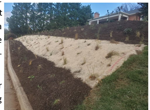
Warren County Conservation Landscaping Completed